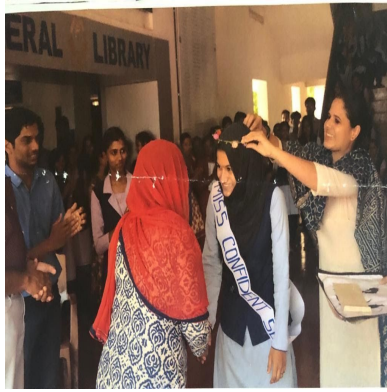
AWARDING THE CONFIDENT