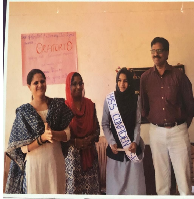
MISS CONFIDENT S.E.S